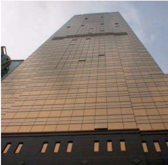
Air conditioning is an important element in high rise office buildings (Guangzhou, China).